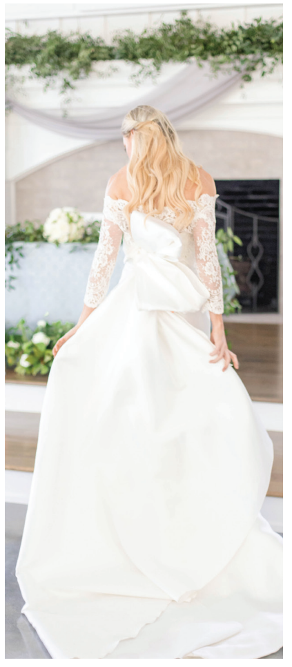
Inspired by the modern farmhouse design of the venue plus light, bright personal touches, each and every detail was perfectly planned...and in true southern style. The soft florals and the show stopping bow accent on the back of the bride's dress added beautiful, delicate statements.