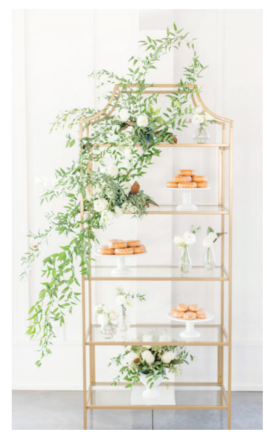
The venue created a blank, white canvas for the hints of pale blue and the organic greenery, which added timeless touches to everything from the modern cake table to the scrumptious 5-tiered donut display.